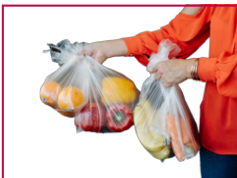
Barrier bags for unpackaged perishable food such as fruit, vegetables, meat and fish