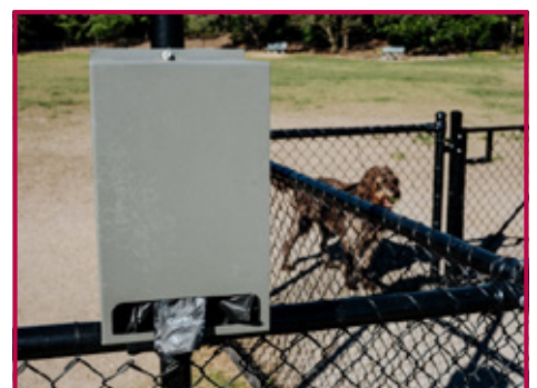
'Dog poo' bags provided by councils at dog parks and beaches

Visit www.qld.gov.au/plasticbagban and subscribe to the WasteNOTes newsletter to stay up to date on how the government is managing plastic waste.