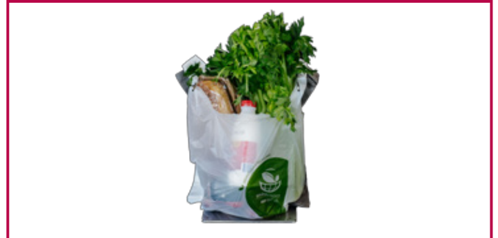
Biodegradable and degradable lightweight plastic shopping bags