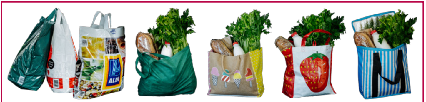
Reusable bags, which include: heavy-duty plastic bags designed for reuse or multiple uses, 'green' (woven polypropylene) bags, hessian bags, and freezer or 'cold' bags