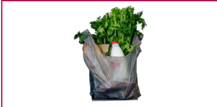
HDPE (standard petrochemical) lightweight plastic shopping bags