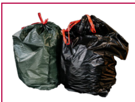
Garbage bags and bin liners